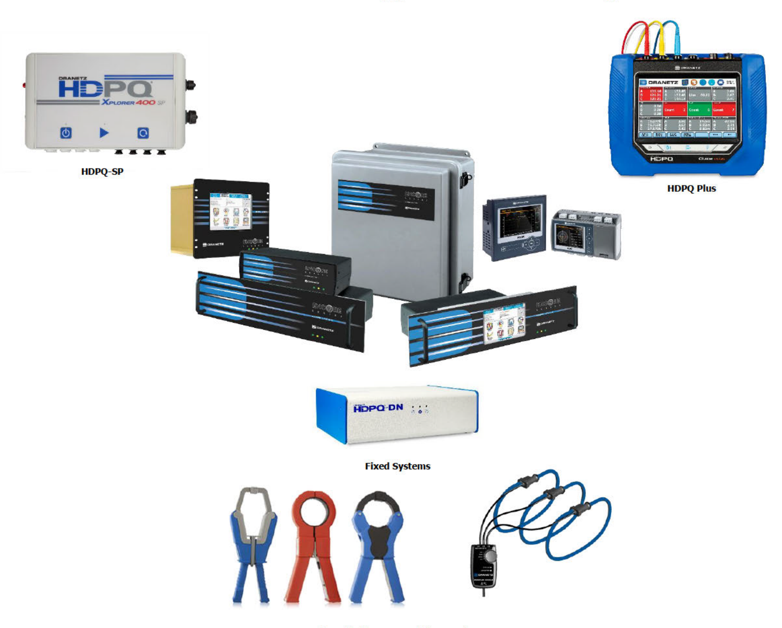
Dranetz Measurement Accessories