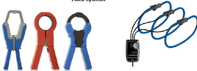
Dranetz Measurement Accessories