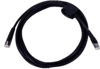
10 Base T standard 6' cable