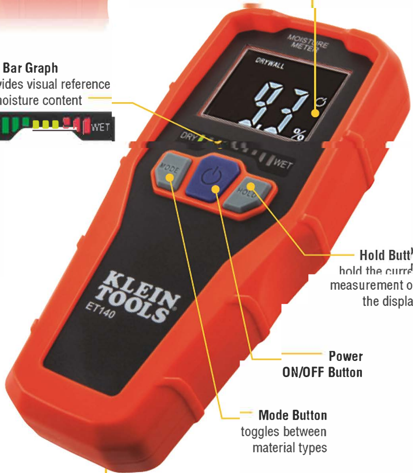
Hold Button hold the current measurement on the display