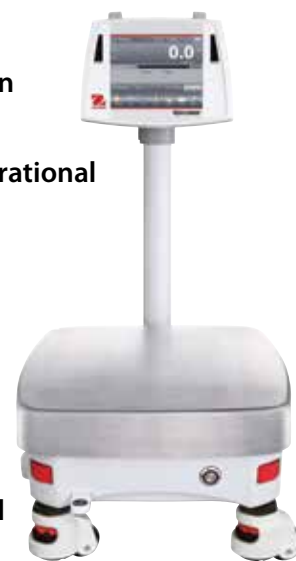
Shown with optional tower mount and rolling feet