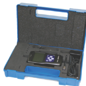
FG-3000 with Accessories in Protective Carrying Case