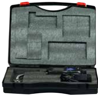
FG-3000R with Accessories in Included Carrying Case