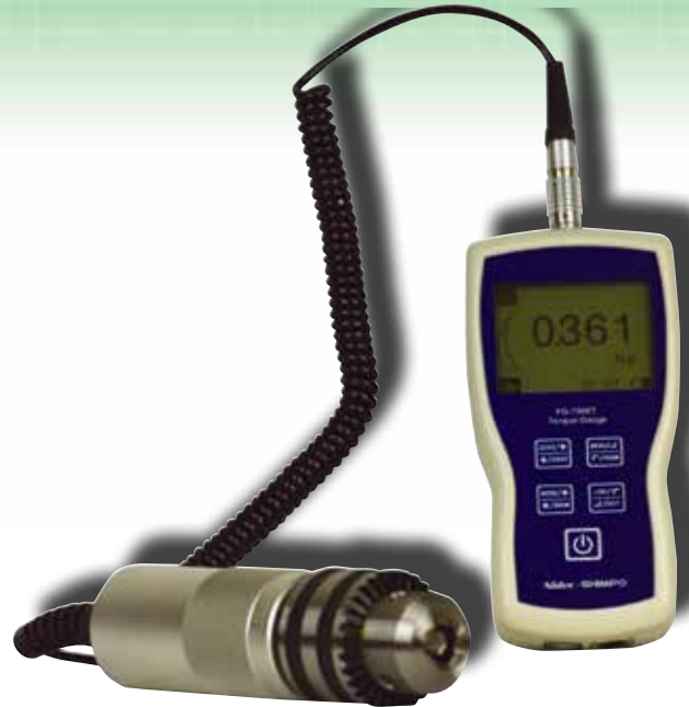
FG-7000T with Included Accessories and Carry Case