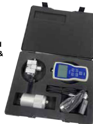
FG-7000TA with Included Accessories & Carry Case