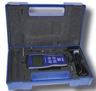
FG-7000 with Accessories in Protective Carrying Case