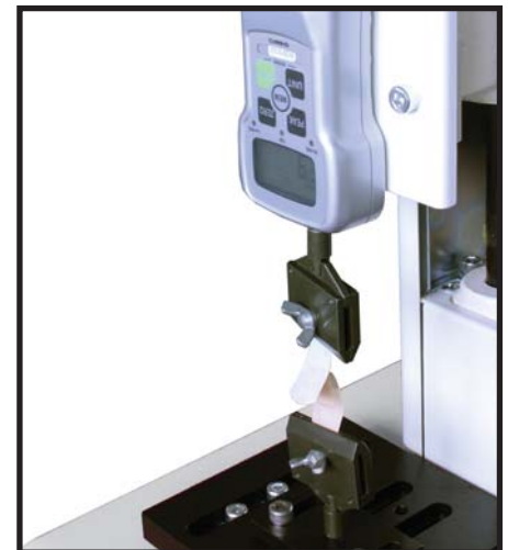
Stand with Optional Grip Performing Peel Test