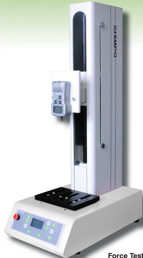
Force Test Stand shown with Force Gauge (Sold Separately)

The FGS-VC's can be equipped with various gripping and compression fixtures and are compatible with all Shimpo Force Gauges as well as most gauges on the market. These features make the new FGS-VC the ideal push/pull tester for the production line or QC lab.