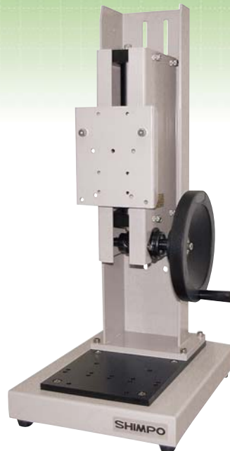
FGS-100H Hand Wheel Test Stand