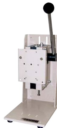
FGS-50S Lever Test Stand