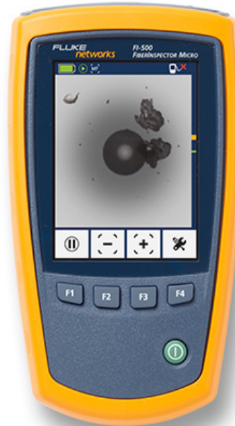
FI-500 displaying a dirty fiber endface