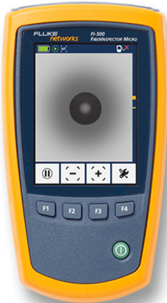
FI-500 displaying a clean fiber endface