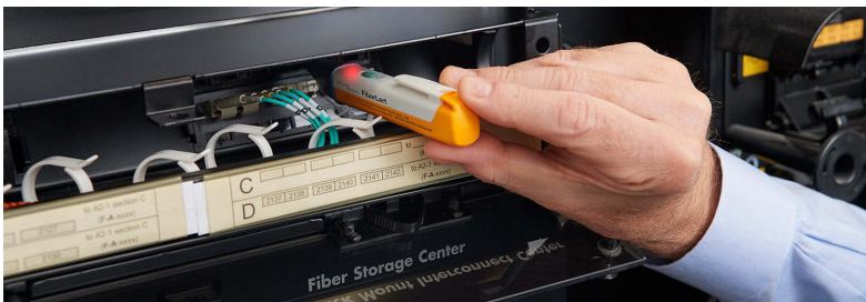
Determine if a port is live. Small size makes it easy to access cramped patch panels.