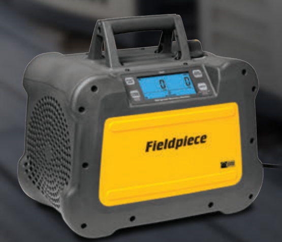
Recovery Machine MR45