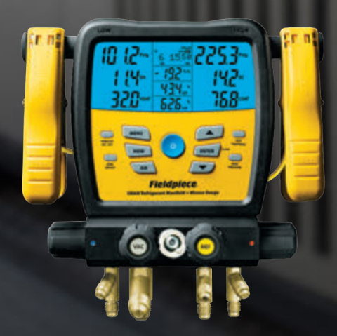
Refrigerant Manifolds SM480V, SM380V