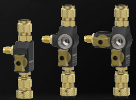
Valve Core Removal Tools VC1, VC1G, VC2G