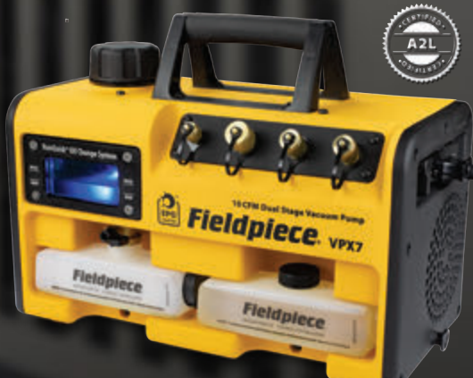
Vacuum Pumps VPX7, VP87, VP67