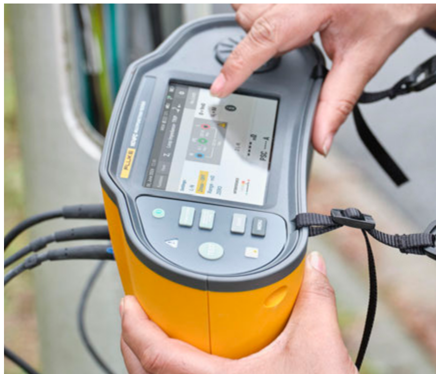
Full-color touch screen and tactile rotary knob for fast navigation

Simplify report generation with automatic report population, Fluke Connect integration, and one-touch reporting with Fluke TruTest™ software.