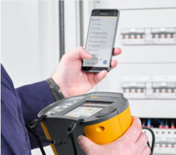
Reduce manual data entry and recordkeeping