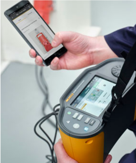
Assign photos directly to specific test points for more detailed documentation