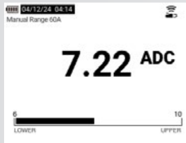
Limit gauge – within range

The CAT III 1500 V/CAT IV 1000 V rated 283 FC multimeter and a283 FC wireless current clamp meet the safety requirements for test equipment (IEC 61010-2-032) corresponding to the overvoltage category level of the PV array electrical installation (IEC 61730-1). Combine these with CAT III 1500 V/CAT IV 1000 V rated TL175-HV Premium Silicone Test Leads, CAT III 1500 V MC4 connectors and you've got a comprehensive frontline troubleshooting solution that offers safe and accurate voltage measurement for troubleshooting everything from the inverters, combiners, strings of modules, or individual modules.