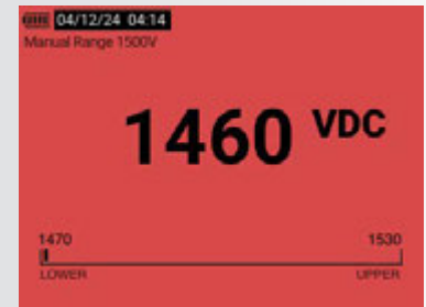
Limit gauge – outside of range