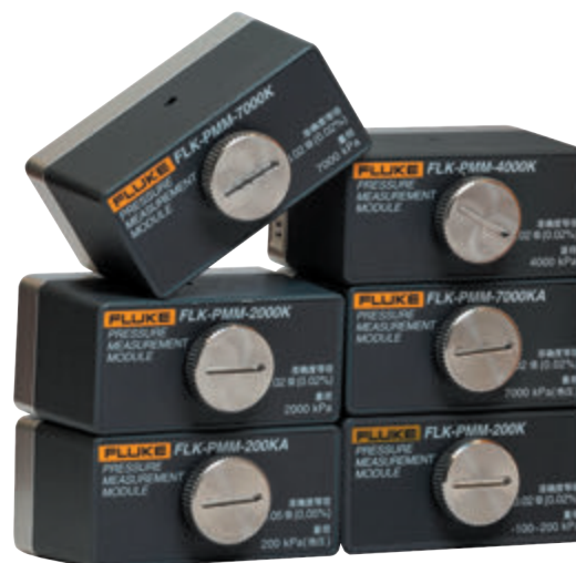
Figure 1. Rechargeable lithium battery with capacity indication.

HART communication enables mA output trim, trimmed to applied values, and pressure zero trimming of HART pressure transmitters. You can easily change a transmitter tag, measurement units and ranges. Other supported HART commands include setting fixed mA outputs for troubleshooting, reading device configuration parameters and reading device diagnostics.