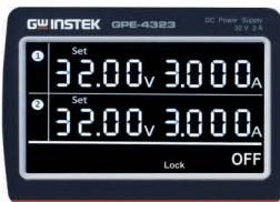
4.3 Inch LCD display provide high resolution for 10mV/1mA

The GPE-X323 series features 10mV/1mA high resolution (for setting and read back). The series outputs a pure and stable power supply. Users can easily simulate small voltage or small current measurements for DUTs that is the area the conventional low resolution linear power supplies can't achieve.