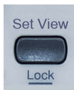
The key lock function prevent DUTs from unnecessary damages caused by mis-operation.

The GPE-X323 series has a built-in set view and key lock so as to expedite the operation process. The key lock function protects DUTs by preventing others from changing voltage/current parameters.