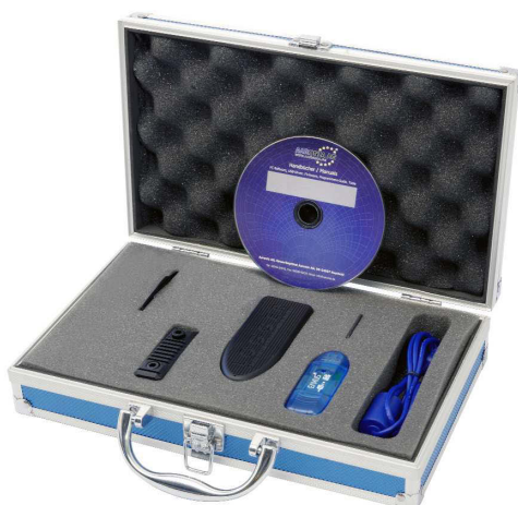
Scope of delivery