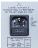
Universal Input Voltage Range

Additionally, the GPT-9600 series provides the universal input voltage range for operating equipment in countries with different electrical power standards. With the GPT-9600 series, the hustle of switching or selecting input voltage range can be left behind. Furthermore, 50Hz or 60Hz can be selected to provide a stable and appropriate test voltage without relying on the electrical environment conditions of input power so as to meet the test requirements.