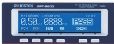
Large LCD, High Intensity Indicators and Function Keys

The 240 x 48 display clearly shows the applied voltage, test parameters, test conditions, measurement value and result on the screen at the same time. The real-time status update on the LCD display accompanied by the multi-colored LED status indicators on the front panel allow operators to have a full control of the test process to perform precession test and avoid unnecessary operation risks at the same time. The status indicator above the high voltage output terminal will automatically flash when an output is in place. In addition, the function keys arranged below the LCD display provide convenient operation that test functions can be easily changed by a single pressing.