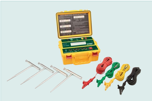
Complete with test leads with alligator clips, 4 auxiliary earth bars, hard carrying case, and eight 1.5V AA batteries