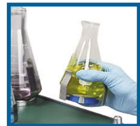
MAGic Clamp Platform H1010-MR with Adjustable MAGic Clamp (H1000-MR-CMB)