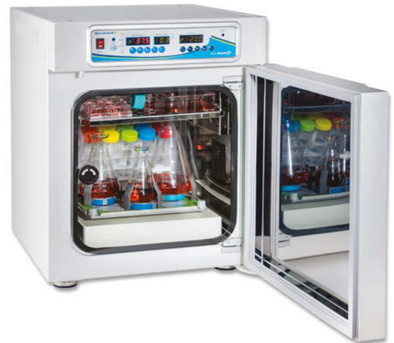
INCU-SHAKER CO2 Mini

Compact footprint with exceptional performance and reliability