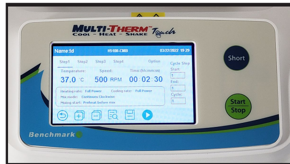
Complete touch screen control

Easy to use and reliable in operation, the MultiTherm Touch is covered by a 2 year warranty. Blocks and heated lid are sold separately.