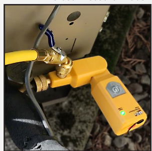
Pass thru port hook up, no hoses or adapters needed.