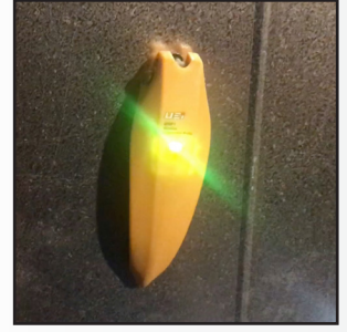
Magnets secure to plenum putting probe in optimum air stream path.