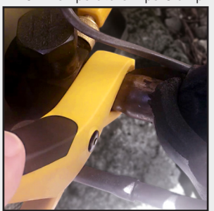
Narrow head for tight spaces with easy opening spring design.