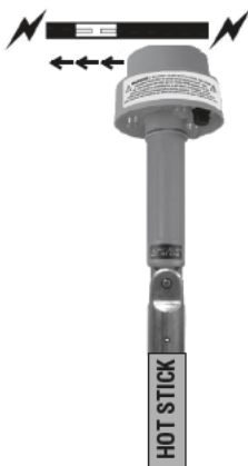
Fig. 2: Finding a cable fault