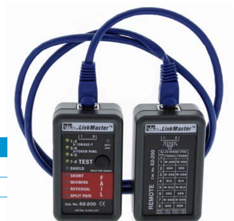
(Cable not included)