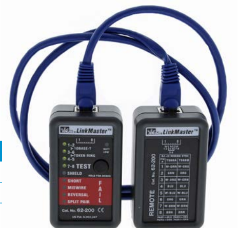
(Cable not included)