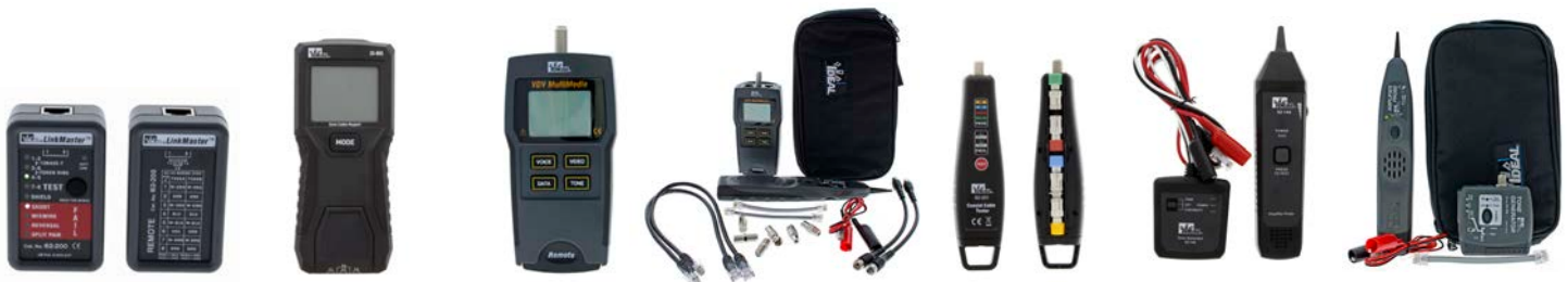
62-200 Linkmaster™ LED Wiremapper

The newly expanded line of IDEAL Datacom Testers provides accurate and reliable verification and troubleshooting functionality for twisted pair, coax, and copper cabling. Three unique models of twisted pair Wiremappers identify errors in pin-out termination as well as issues with cable continuity. Two Tone and Probe kits for tracing and locating de-energized copper cables. Rounding out the line-up is a new Coax Mapper that identifies up to four coax locations and provides a pass/fail for cable continuity.