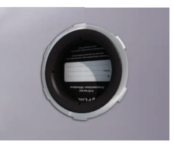
Single PIRma-Lock™ ring nut.