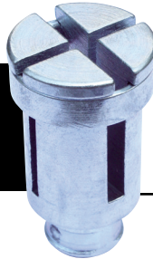
Wire & chain adapter included.

Versatility comes from the unique adapter heads that are specific to each application.