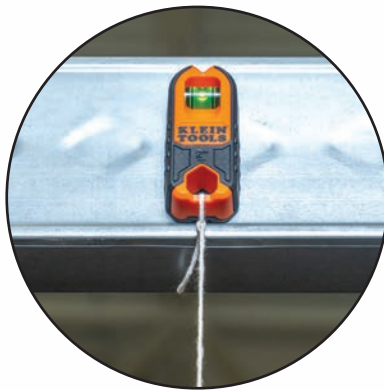
Use with a plumb line