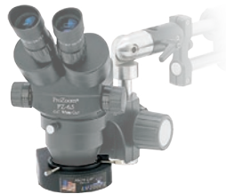
Fits Most Popular Microscopes on the Market Today!