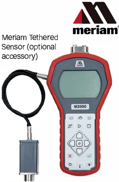
Meriam Tethered Sensor (optional accessory)