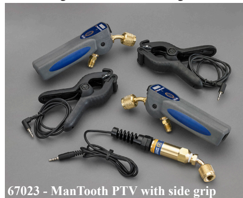
67023 - ManTooth PTV with side grip

The YELLOW JACKET ManTooth-PTV (67023) shown below provides the full set for high and low side readings which includes dual non-tethered pressure/temperature gauges, two wired temperature clamps, and one interchangeable vacuum gauge. The single ManTooth- PTV (67021) can be combined with an