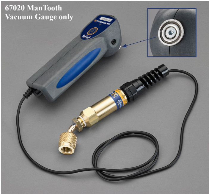
67020 ManTooth Vacuum Gauge only

Eliminate tools, save time, and monitor vacuum process wirelessly.