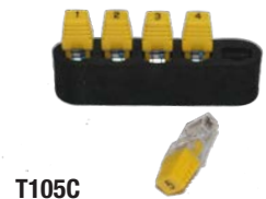
T105C ID Only Network Remotes #1-5, w/ Foam Holder