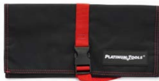
4007 Hanging Pouch