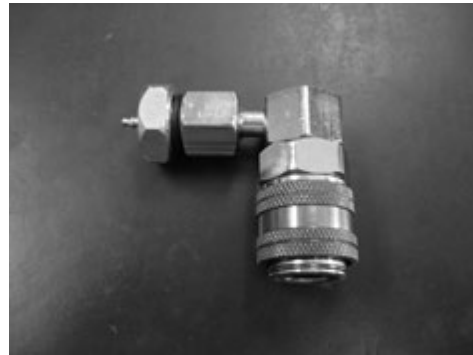
Coupler with Filter

Neutronics to insert photo of unit upon receiving Mastercool labels.