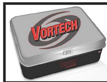
Custom packaging for a custom tool