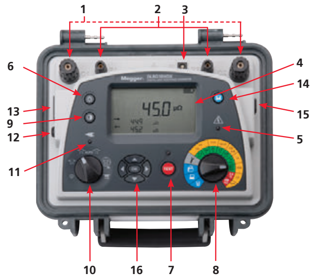
DLRO10HDX Instrument Overview