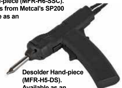
Desolder Hand-piece (MFR-H5-DS). Available as an accessory; see page 3