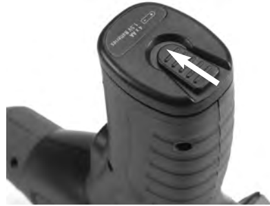
Figure 3 – Battery Door