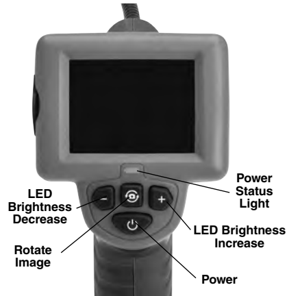
Figure 2 – Controls