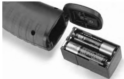
Figure 4 – Battery Compartment