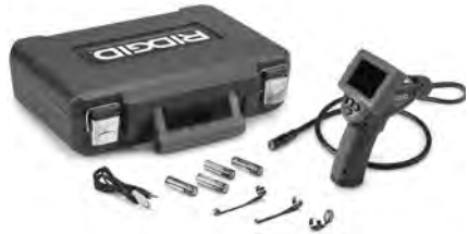
Figure 1 – micro CA-25