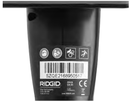
Figure 6 – Warning Label