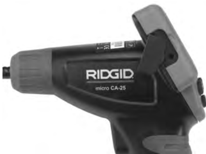
Figure 8 – TV-OUT Jack

Insert the other end into the Video In jack on the television or monitor. The television or monitor may need to be set to the proper input to allow viewing.