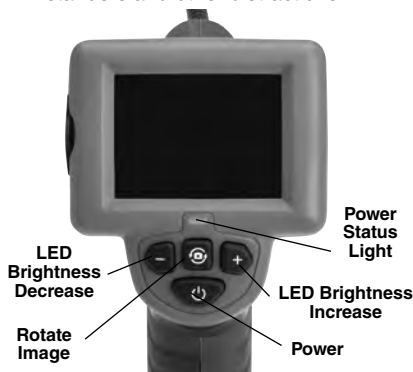
Figure 7 – Controls