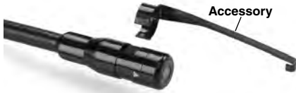
Figure 5 – Installing Accessories