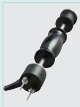
MO290-HP Moisture Hammer Probe