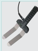
MO290-BP Moisture Baseboard Probe