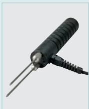
MO290-EP Moisture Extension Probe