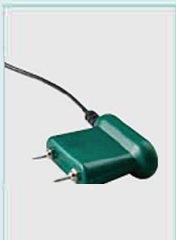
M0290-P Moisture Pin Probe