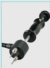
M0290-HP Moisture Hammer Probe