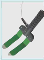
M0290-BP Moisture Baseboard Probe