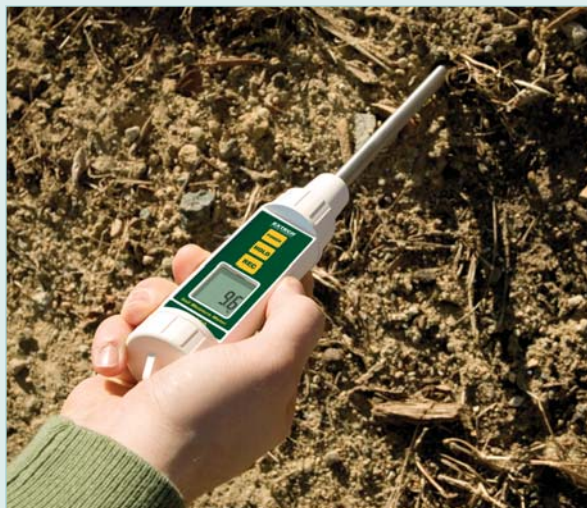
Check the moisture of soil content to insure healthy plant growth