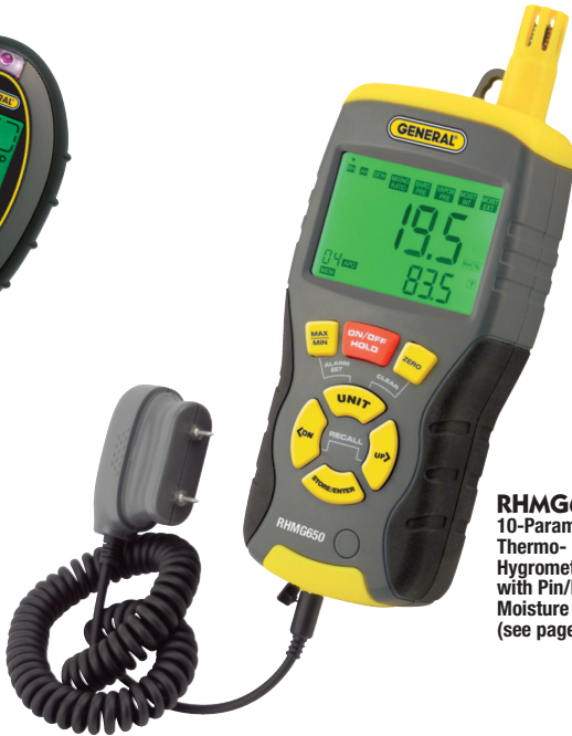
RHM650 10-Parameter Thermo- Hygrometer with Pin/Pinless Moisture Meter (see page 9)