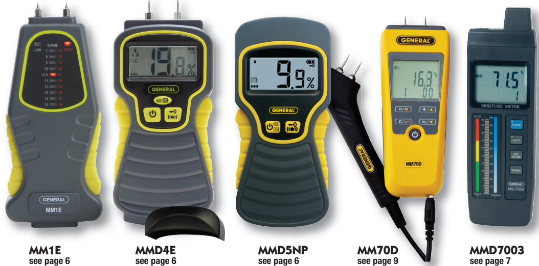
MM1E see page 6

We're especially excited about our new MMD950, with its "magic" sphere that can sense moisture 4 inches below a hard surface. This instrument and its siblings demonstrate that when it comes to construction materials like wood, concrete and wallboard, General has the right moisture measurement tool for you.