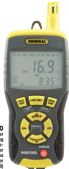
RHM700 13-Parameter Data Logging Thermo- Hygrometer with Pin/Pinless Moisture Meter (see page 9)