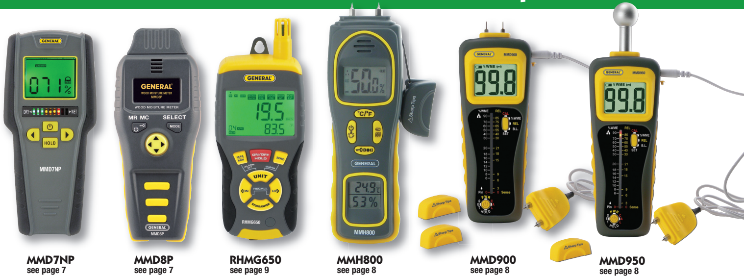
MMD7NP see page 7