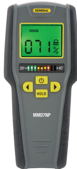
MMD7NP Pinless LCD Moisture Meter with Tricolor Bar Graph (see page 9)