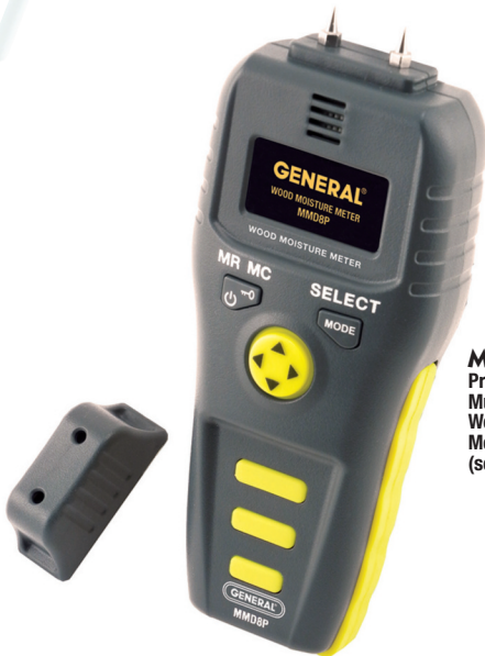
MMD8P Precision Multi-Species Wood Moisture Meter (see page 8)