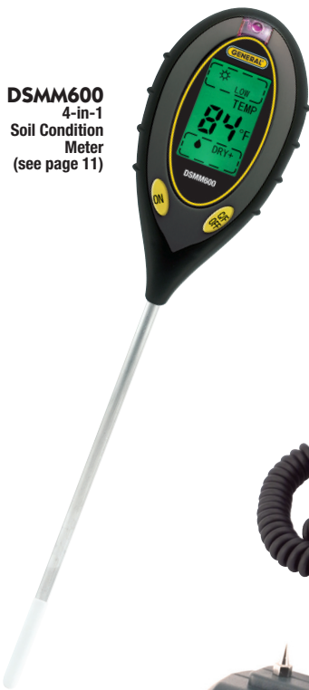
DSMM600 4-in-1 Soil Condition Meter (see page 11)