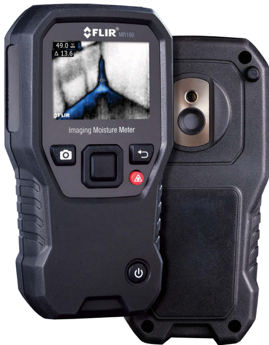
MR160 Imaging Moisture Meter