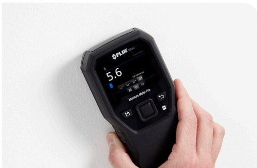
Verify moisture with pinless measurements