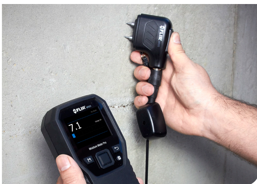
External pin probe for resistive moisture readings