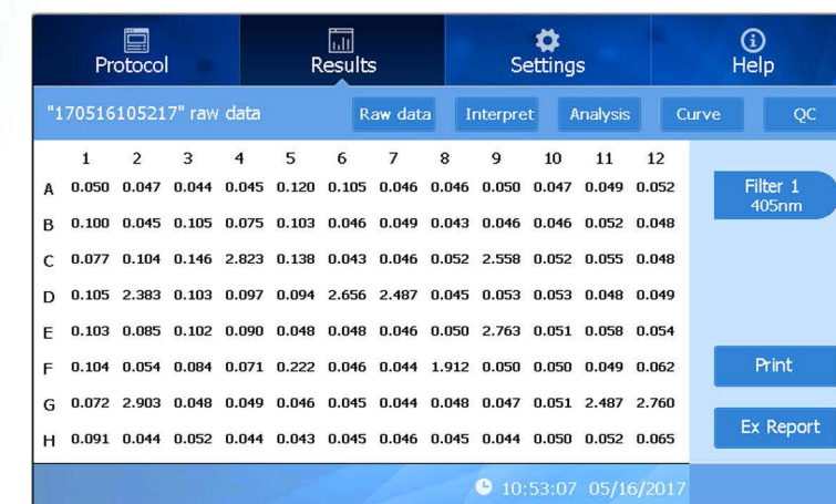
Reading Results Screen

Measurement data is available immediately on the screen after a reading, as well as interpretations, calculated analysis and curve fittings.