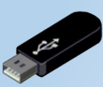
Data Transfer via USB