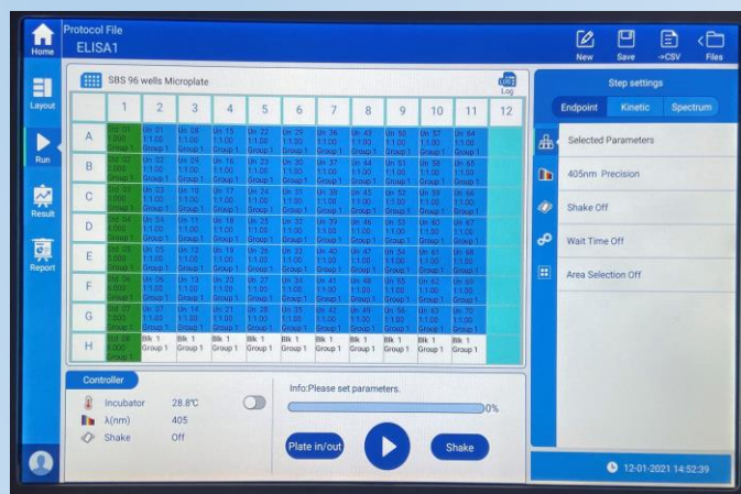
96-well Plate Layout Screen