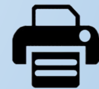
Thermal Printer Available