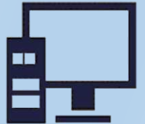
PC Software Available