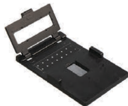
SmartDrop™ Accessory Plate