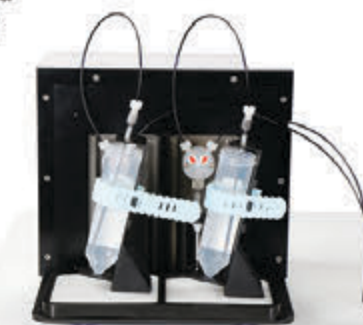
Automatic Injection Module

The SmartReader Multimode is capable of luminescent detection and can process both flash and glow assays. An advanced PMT (photo multiplier tube) enhances sensitivity of weak signals, prevents over-saturation of strong signals, and provides an ideal detection range for all common luminescence applications. Up to 2 sample injectors (available separately) can be installed and are compatible with both 96 and 384-well plates.