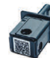
Fluorescence Filter Module

Three filter modules are included to provide the most common excitation and emission wavelengths needed for fluorescence assays. Additional filter modules are available. These advanced modules incorporate dichroic mirrors with narrow band-pass optical filters and ensure high light transmission, increased detection sensitivity, and are easily exchanged. Modules are barcoded for automatic loading of wavelength data. The SmartReader Multimode allows for automatic dynamic range selection, which allows for the gain of the photomultiplier tube to accurately capture and normalize the signal intensity of samples.