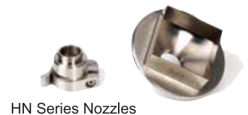
HN Series Nozzles