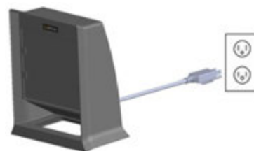
Plug into outlet